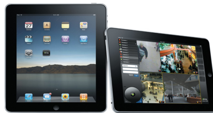
iPad Advanced Application